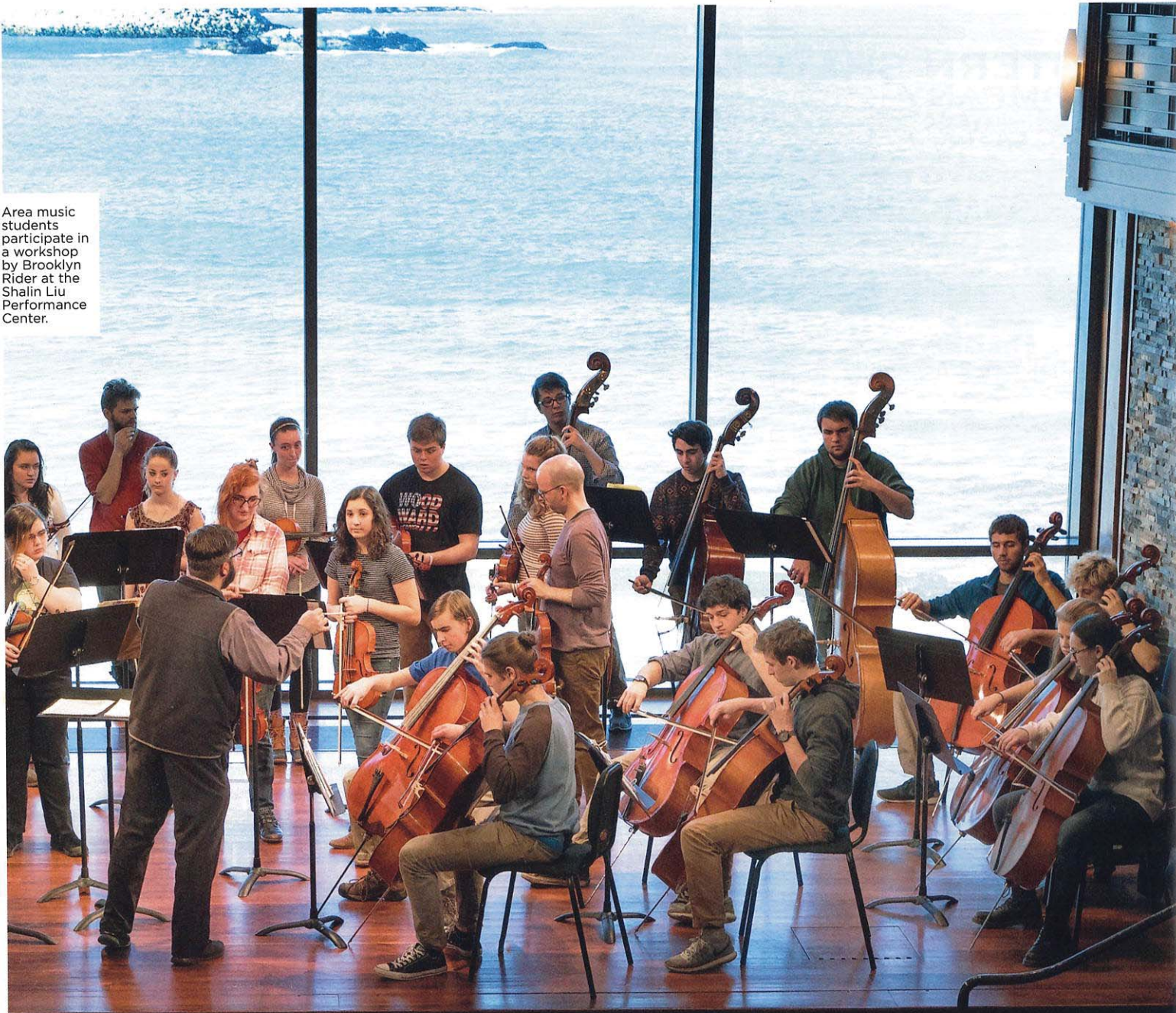
Area music students participate in a workshop by Brooklyn Rider at the Shalin Liu Performance Center.