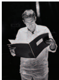
Mihai Mălăințare © 2009