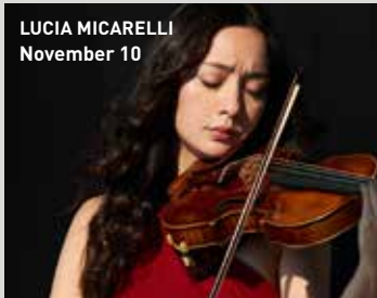
LUCIA MICARELLI November 10