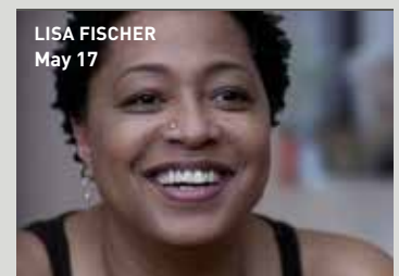
LISA FISCHER May 17

Tuesday, May 5, 7:30–9PM Tuesday, May 12, 7:30–9PM ADULT MUSIC MAKING CLASSES Thursday, May 7, 7PM PALAUER STRINGS WITH WARP TRIO Saturday, May 9, 12:55PM Met Opera in HD: MARIA STUARDA Saturday, May 9, 8PM HANNEKE CASSEL Saturday, May 16, 2PM | FREE BOSTON CITY SINGERS Sunday, May 17, 7PM LISA FISCHER