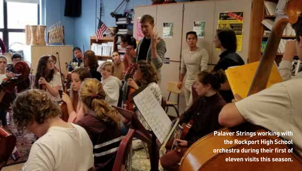
Palaver Strings working with the Rockport High School orchestra during their first of eleven visits this season.