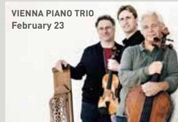
VIENNA PIANO TRIO February 23

Saturday, February 1, 12:55PM Saturday, February 8, 1PM Met Opera in HD: GERSHWINS' PORGY & BESS