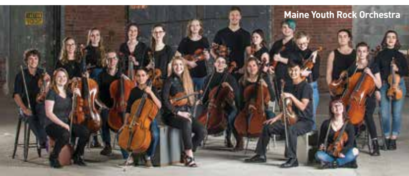
Maine Youth Rock Orchestra