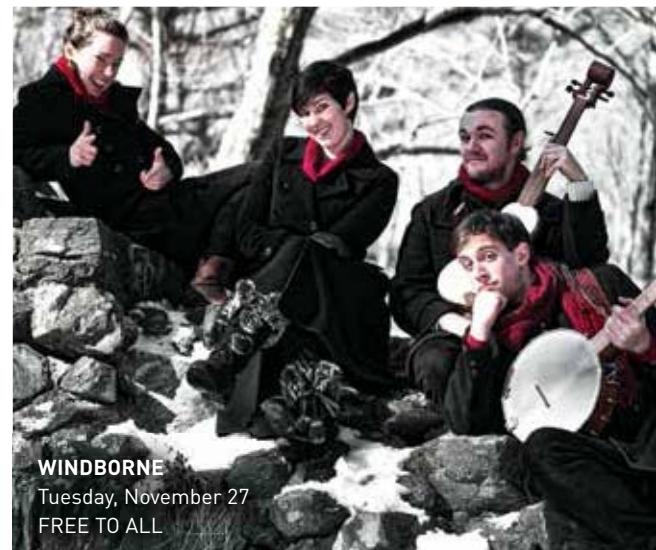
WINDBORNE Tuesday, November 27 FREE TO ALL